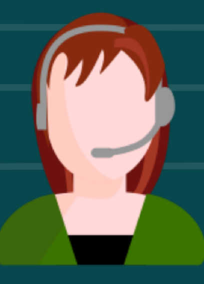
Alex Agency for Vehicle Standards